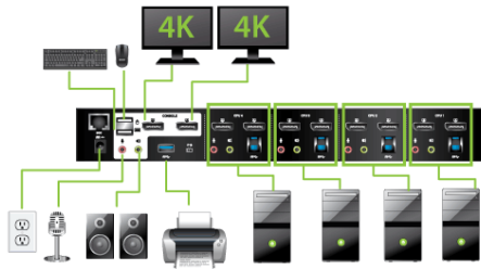
Quad View (DCC Mode)